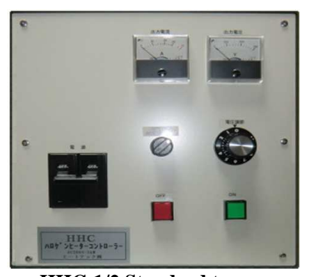
<< HHC-1/2 Standard type >>