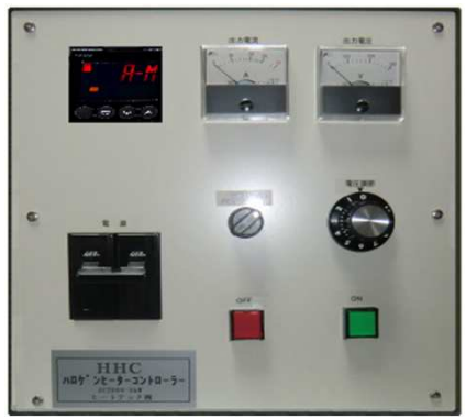
<< HHC-1/2 Thermo controller type >>