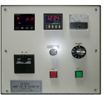
<< HHC-1/2 Thermo controller and Timer type >>